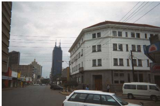
This picture shows Kenya's capital city which is Nairobi. It is usually a busier town during the weekdays than on the weekends.