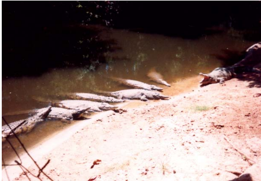
Mambo Village at the coast. Mamba means crocodile in Swahili. It's a crocodile park at the coast.