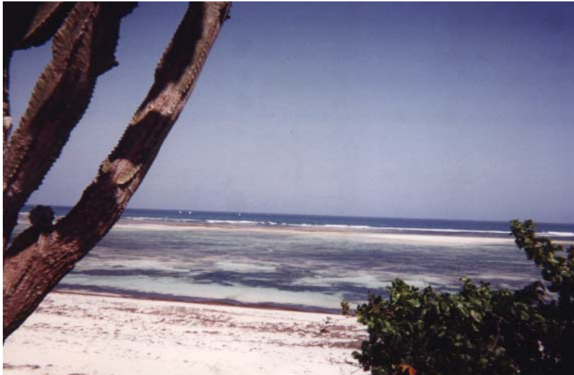
A beautiful view of the Indian Ocean from a hotel balcony in Mombasa town.