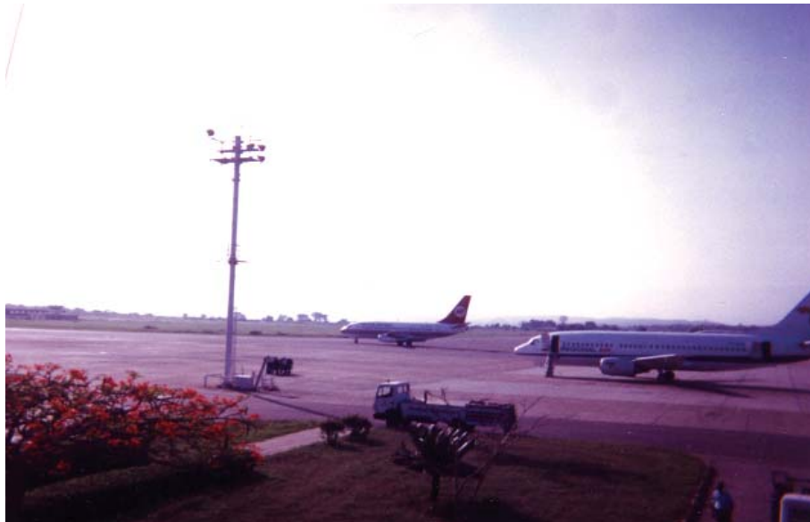
Moi International Airport in Mombasa at the coast of Kenya. It's one of the busiest airports in Kenya because many tourists visit the coast more than any other place in Kenya.