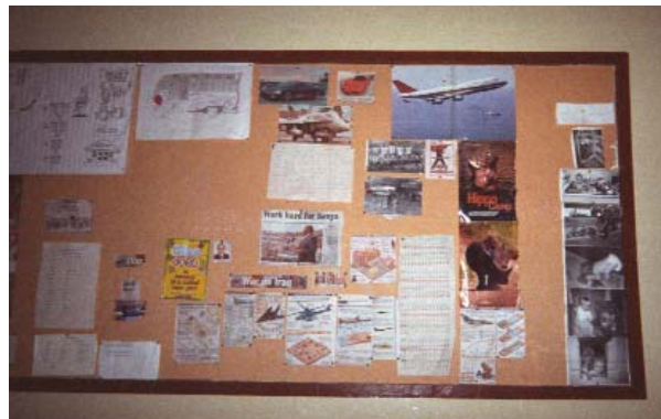
Our class notice board.