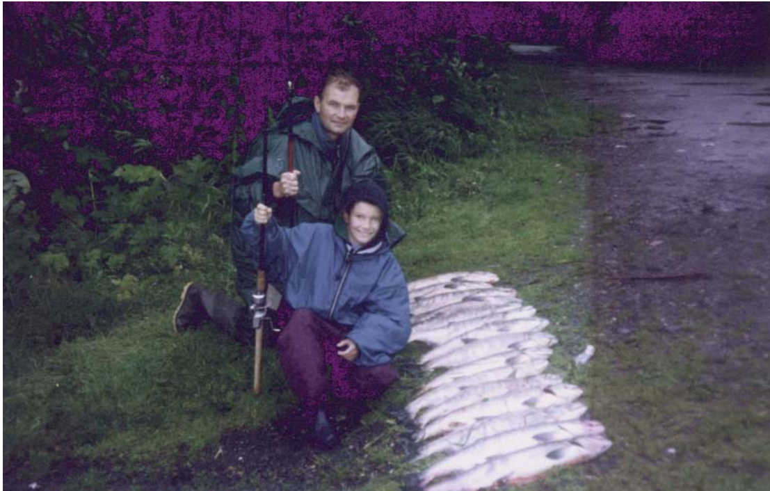
A fisherman's fortune was smiling at us today.