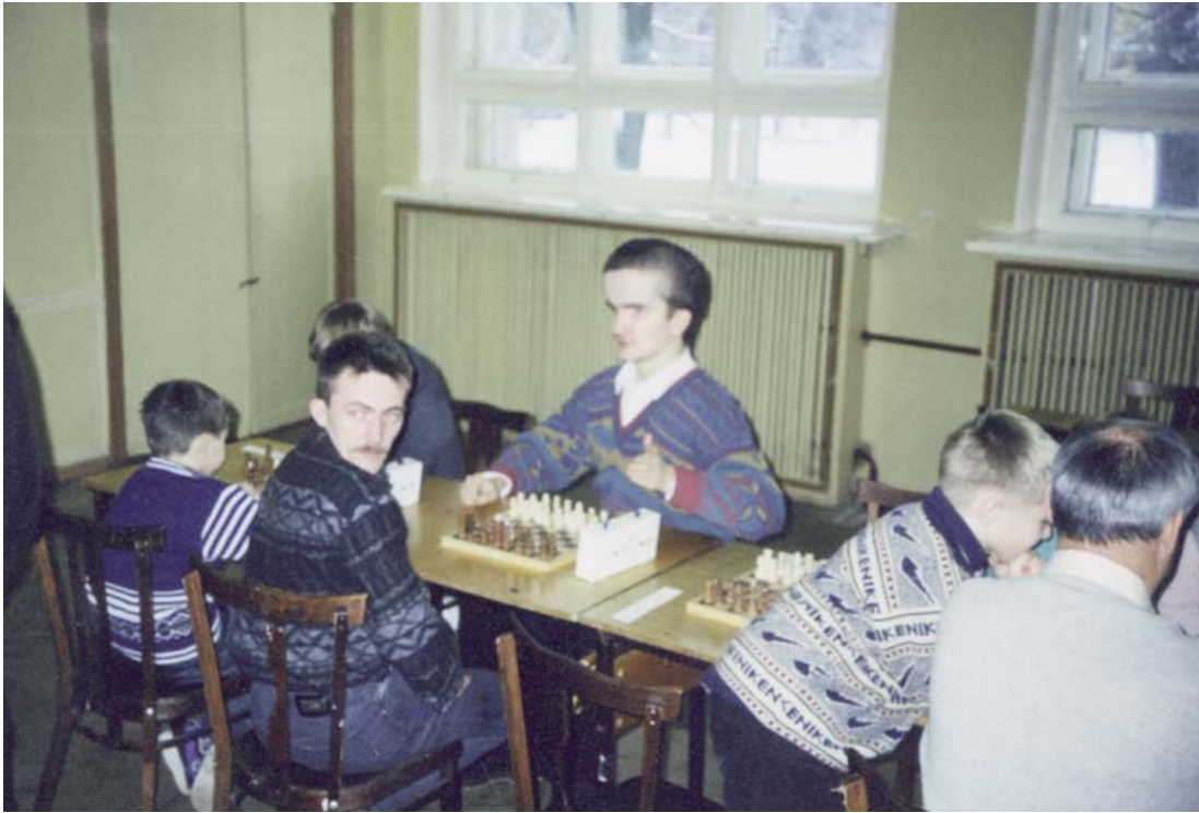
I like to play chess in my spare time.