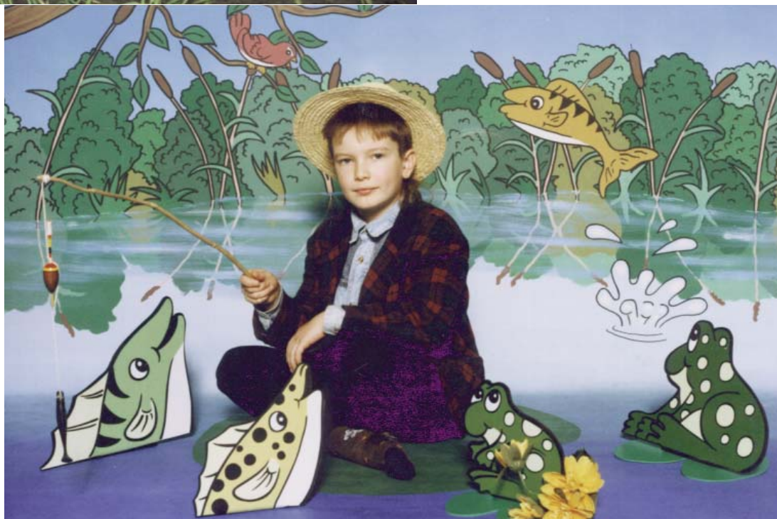
My brother liked fishing since he was a little kid.