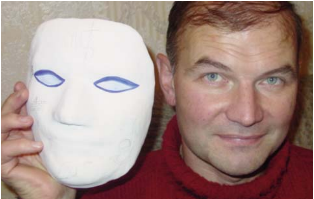
This is my father. He is handsome and smart. He is an engineer and builds good housing.